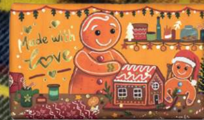
CHX0013 GINGERBREAD CINNAMON & ORANGE