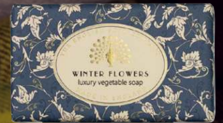
CHX0009 WINTER FLOWERS