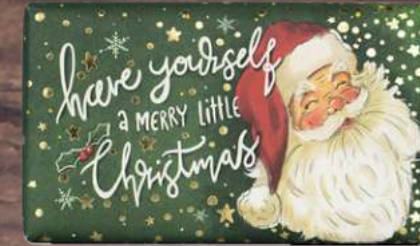
CHX0003 SANTA CINNAMON & ORANGE