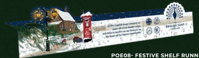
POE08- FESTIVE SHELF RUNNER 450MM X 120MM

Complementing our year round Point of Sale, our beautiful festive shelf runners enhance any display. Available to add to any order, free of charge.