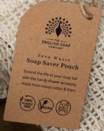
WB001 Soap Saver Pouch # IN CASE: 16

Extend the life of your soap with this mixed cotton and linen shower accessory. These bags fit all our soap bars from the get-go so you can make the most of that luxurious lather, whilst providing you with the perfect solution to make your soap last even longer.