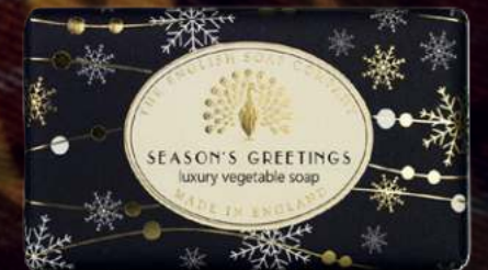
CHX0012 SEASON'S GREETINGS CINNAMON & ORANGE