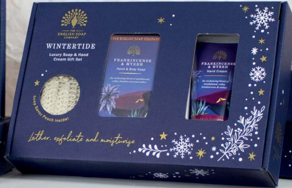
WTGB002 FRANKINCENSE & MYRRH