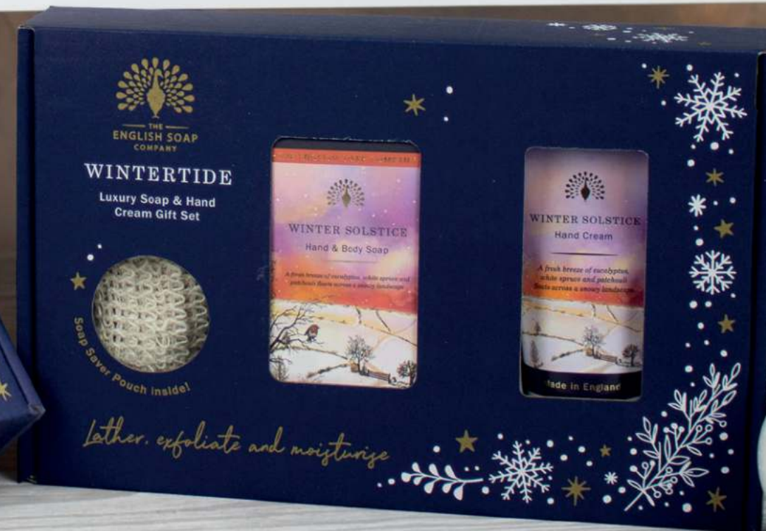
WTGB004 WINTER SOLSTICE