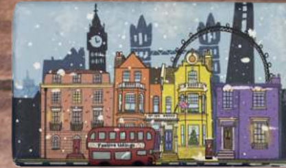
CHX0002 LONDON IN WINTER WINTER FLOWERS