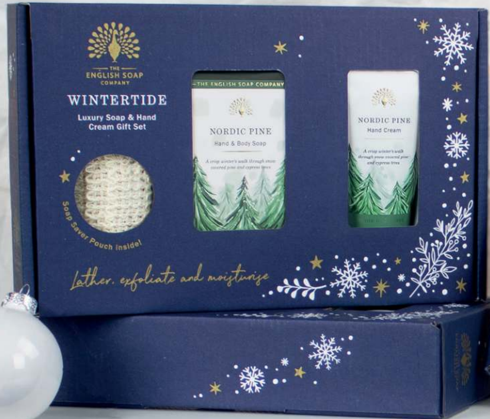
WTGB001 NORDIC PINE