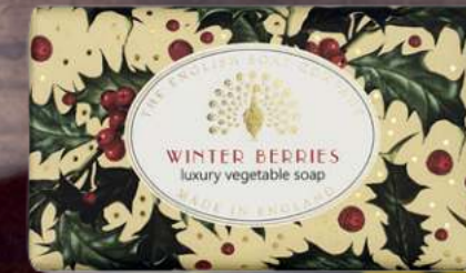
CHX0008 WINTER BERRIES