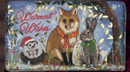
CHX0001 WINTER ANIMALS MULLED WINE