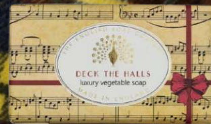
CHX0010 DECK THE HALLS MULLED WINE