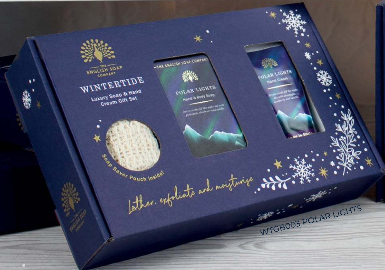
WTGB003 POLAR LIGHTS