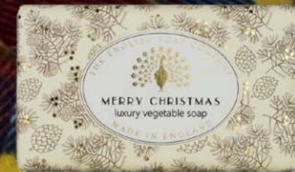
CHX0011 MERRY CHRISTMAS CHRISTMAS GREENERY