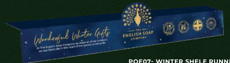
POE07- WINTER SHELF RUNNER 450MM X 120MM