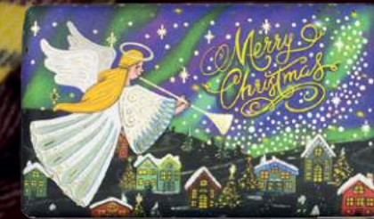
CHX0015 HEAVENLY ANGEL ANGEL