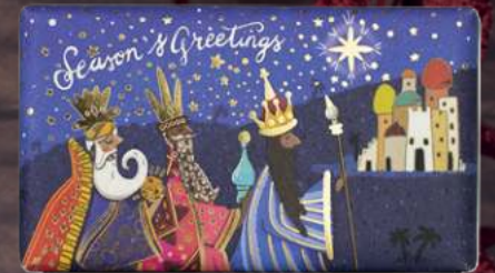
CHX0004 THREE KINGS FRANKINCENSE & MYRRH