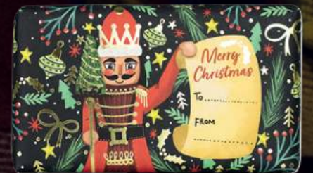
CHX0016 NUTCRACKER FRANKINCENSE & MYRRH